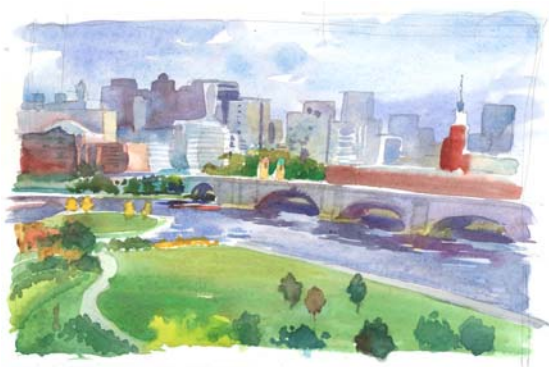
Craigie Bridge & Viaduct