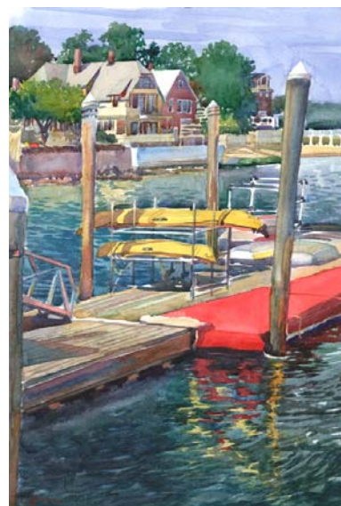
Kayaks Off The Carpet, CPYC

_____ One Day Plein-Air is $125 (Maximum Number 20)