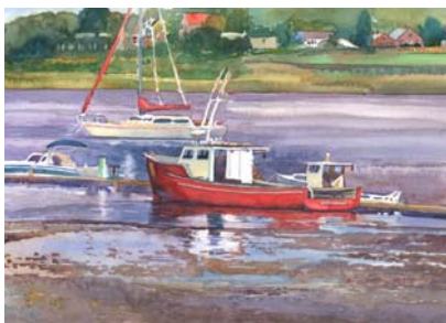
Low Float At Donovan's Beach